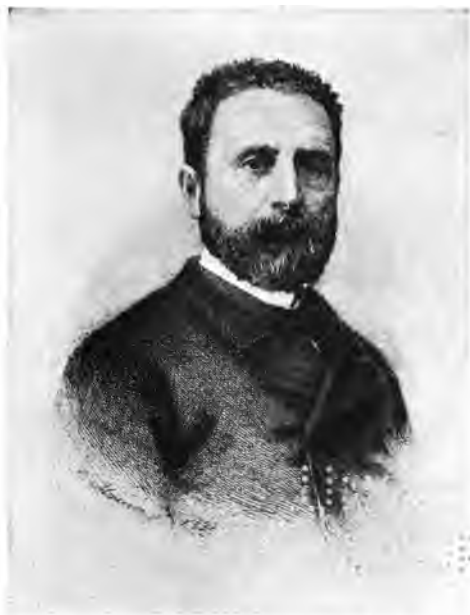
Gaspar Esteban Núñez de Arce